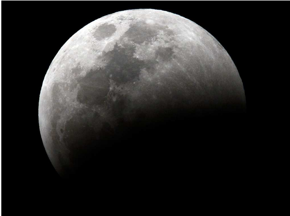
Partial eclipse (penumbra) about half way through - Gedeeltelike verduistering (penumbra) omtrent halfpad