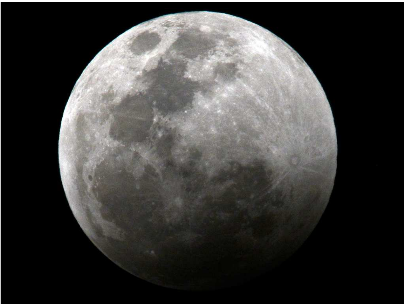
Hier begin die maan net-net verdonker van regs onder af - Here the eclipse has just started - note the darkening bottom right