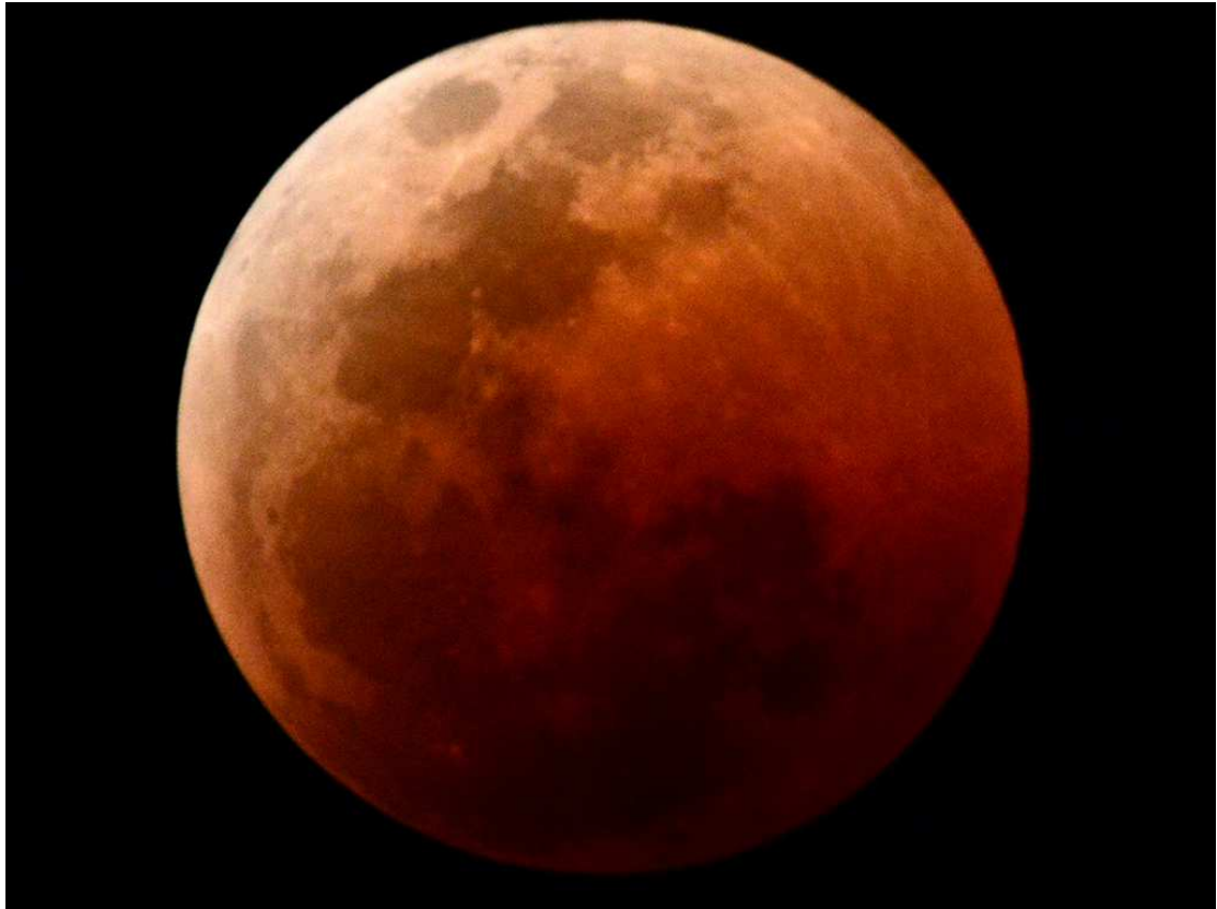
A Blood moon! - 'n Bloedmaan!