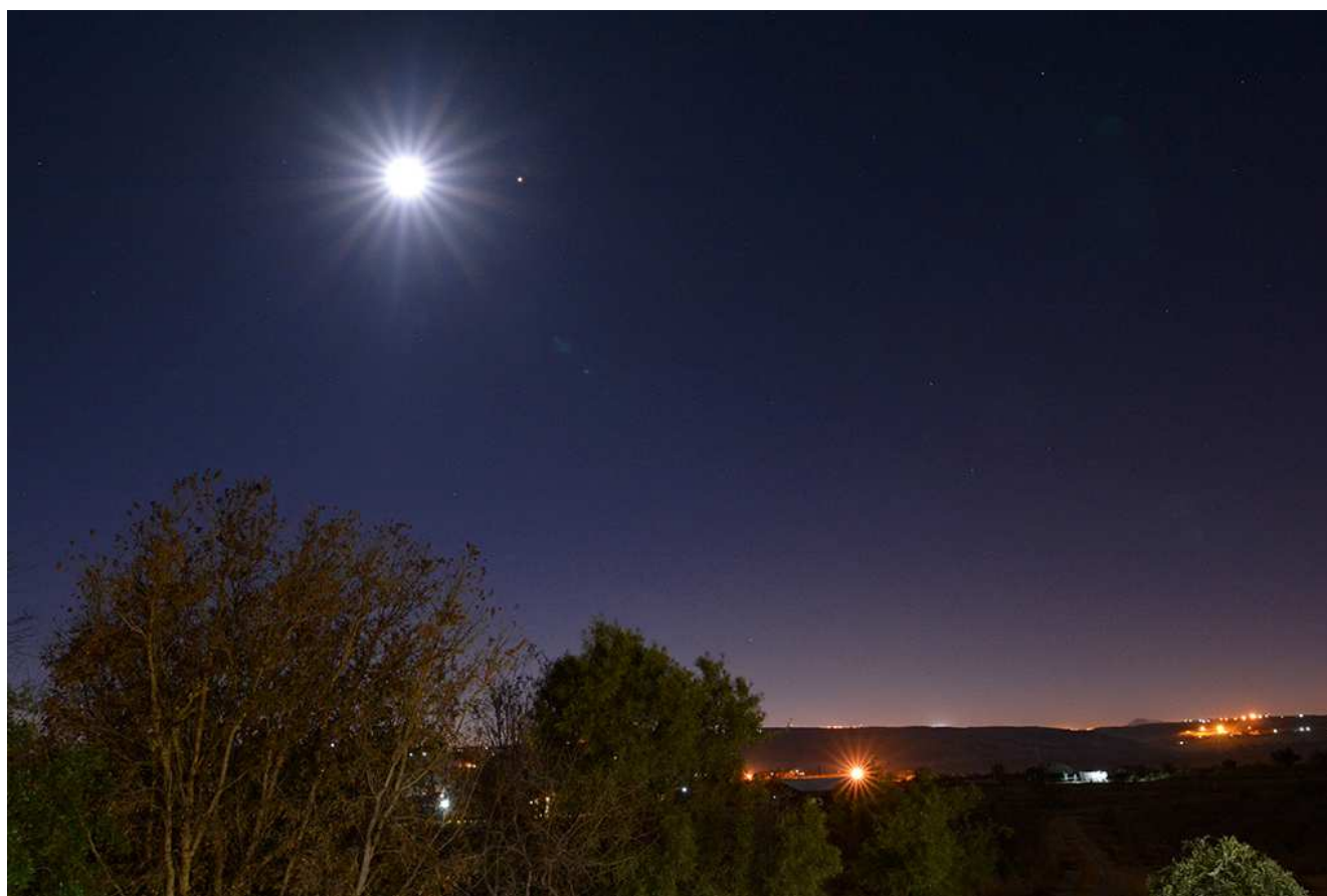
Full moon (just before the eclipse started) with Mars to its right - Volmaan (net voor die eintlike verduistering bein het) met Mars regs daarvan.

We could not wait for the eclipse and were certainly not disappointed! Mars was very bright and as the eclipse progressed, we were in awe. We had the bubbly and snacks ready and thick woollies protected us from a nippy wind. Because this was the longest eclipse (time wise) this century it certainly was special and we thought we'd share it with all of you. I asked Garfield to do a special photo essay to show everyone this natural phenomenon.