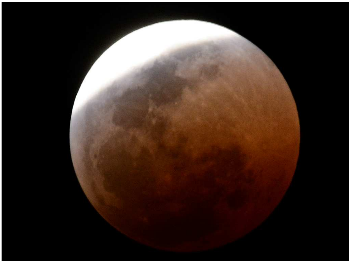
The moon is turning red! - Die maan word rooi!